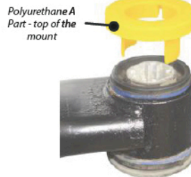
Figure 1 - diagram showing how polyurethane part A fits