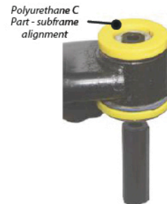
Figure 3 - diagram showing how polyurethane part C fits