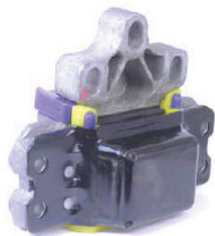
Figure 3 - showing all polyurethane inserts fitted inside the transmission mount