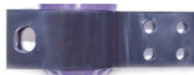
LEFT HAND OF CAR