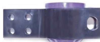
RIGHT HAND OF CAR