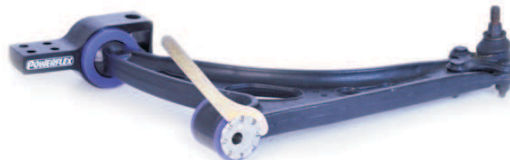
B Bush Front of car