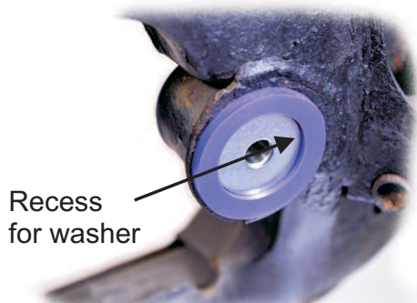
View from front of car