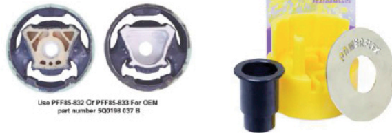
Use PFF85-832 Or PFF85-833 For OEM part number SQ0198 037 B