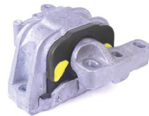
Figure 4 - showing all polyurethane inserts fitted inside the upper engine mount