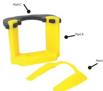
Figure 3 - showing how A and C polyurethane inserts should fit together