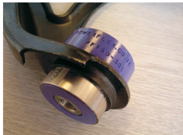
Fig 2: Bush fitted in wishbone