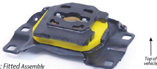
Figure 2: Fitted Assembly