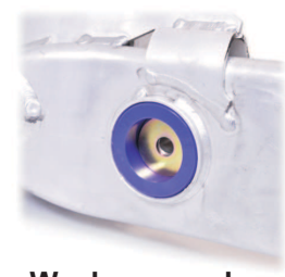
Washer goes here (Rear of car)