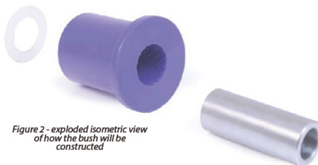
Figure 2 - exploded isometric view of how the bush will be constructed