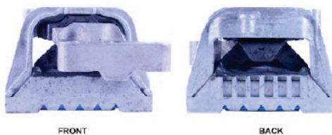
Figure 3 - profile of the Upper engine mount that uses this insert.

PFF85-532 FITS UPPER ENGINE MOUNT WITH THIS PROFILE ONLY