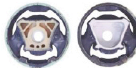
Use PFF85-832 Or PFF85-833 For OEM part number 500198 037 B