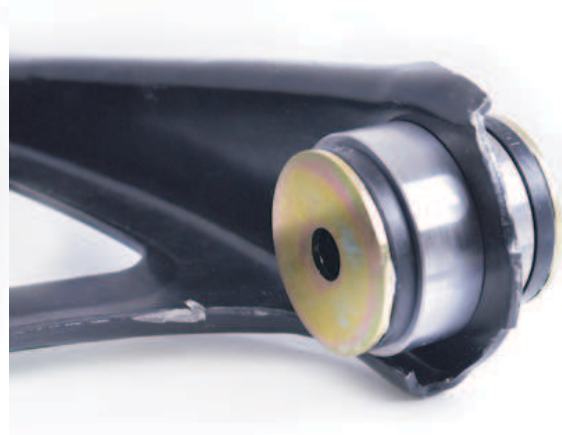
PFF60-301 fitted with washers Ready to fit back onto car.